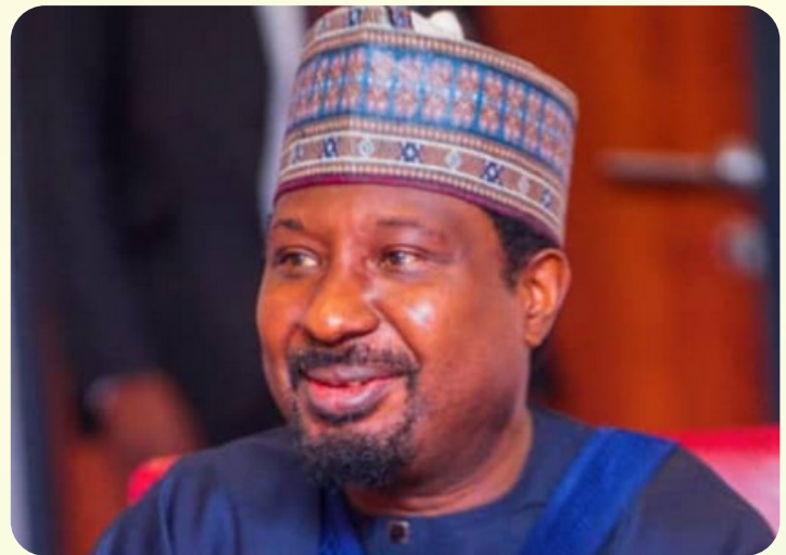
Sen. Barau Jibrin (Deputy Senate President)

Imo State Governor, Distinguished Senator Hope Uzodinma, will on Friday, November 29, 2024, deliver the 12th Convocation Lecture of Michael Okpara University of Agriculture, Umudike, while the Deputy Senate President of Nigeria, Senator Barau I. Jibrin, will chair the occasion.