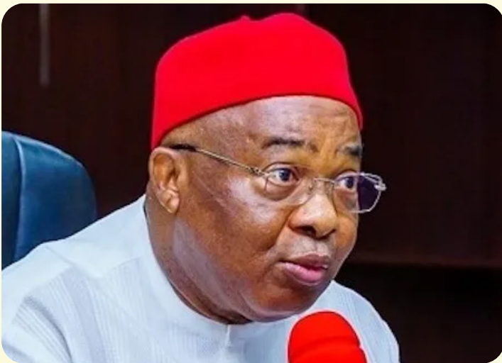
H.E. Distinguished Sen. Hope Uzodinma (Exec. Gov. Imo State)