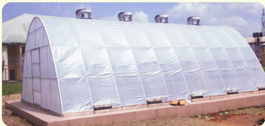
Drier donated by NSPRI