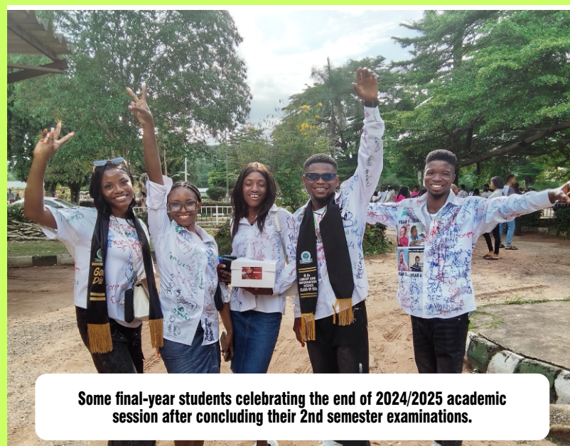
Some final-year students celebrating the end of 2024/2025 academic session after concluding their 2nd semester examinations.