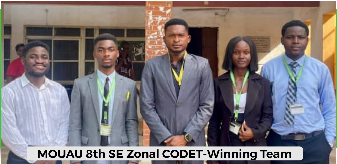
MOUAU 8th SE Zonal CODET-Winning Team

It was another win for Michael Okpara University of Agriculture, Umudike, as 4 of her Engineering Students emerged winners of the 8th South East Zonal Competition of the Committee of Deans of Engineering and Technology in Nigerian Universities (CODET) for Engineering Students, and qualified for the national competition slated for Abuja n July, 2025