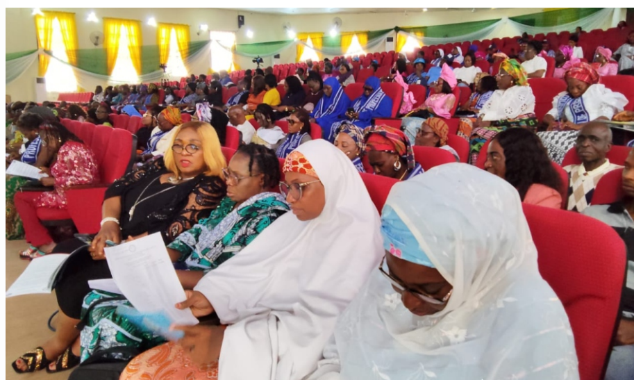
Participants at the 9th Int'l Conference of APROCON in MOUUAU

Prof. Iwe challenged APROCON to rise to the occasion by designing actionable frameworks that will not only address these national issues but also inform policy and empower communities.